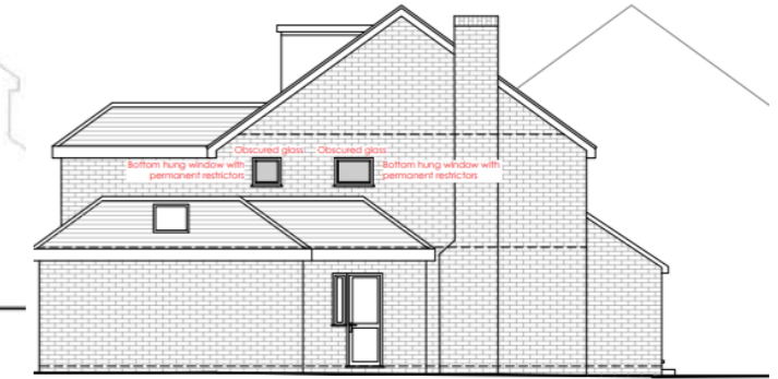
AS-BUILT SIDE ELEVATION