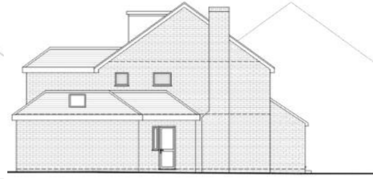
AS-BUILT SIDE ELEVATION