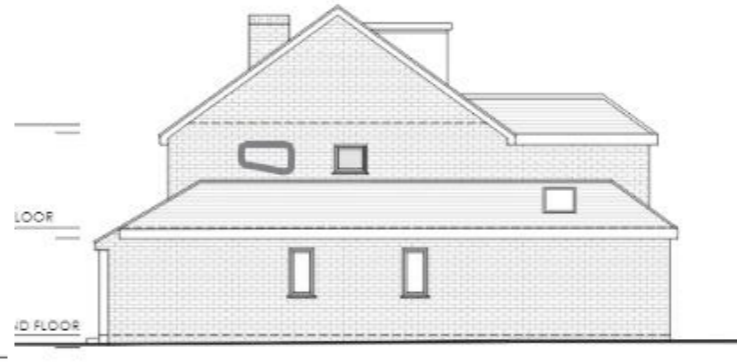
AS-BUILT SIDE ELEVATION