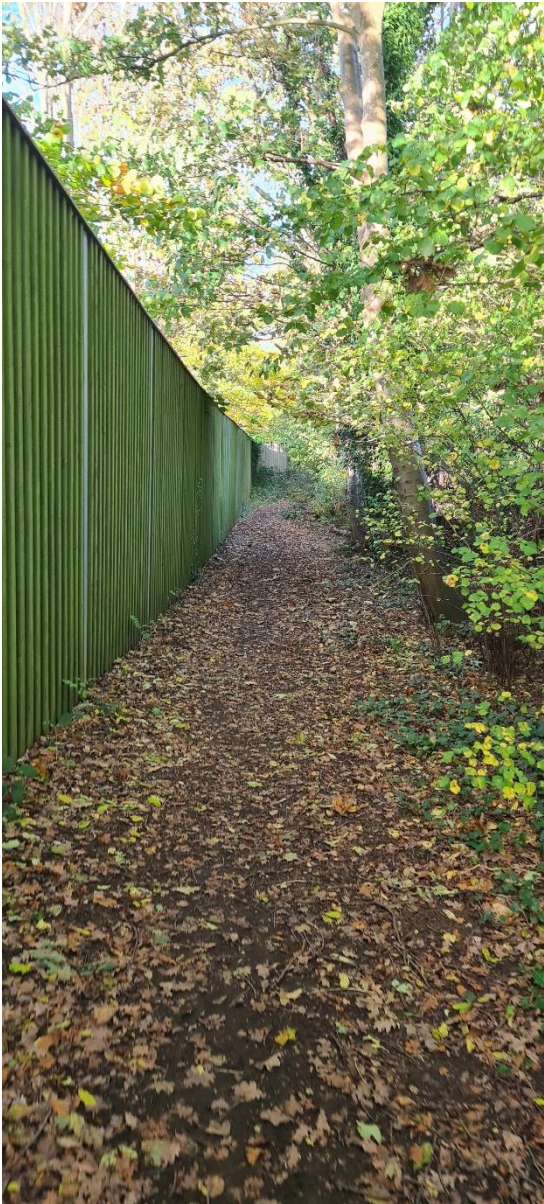
Above = Fence between footpath to rear of site, and M25