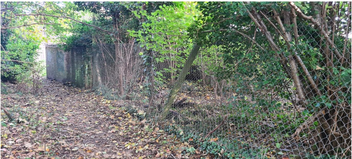
Below = Image of footpath to rear of site (site on right)